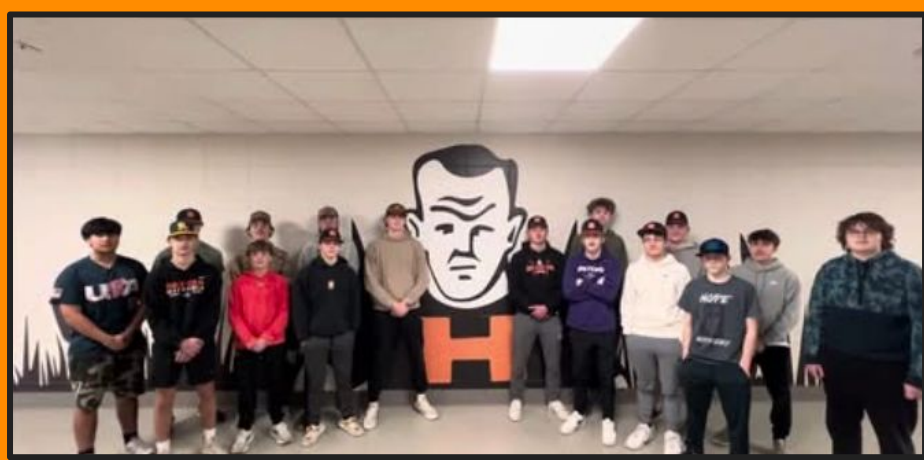
Members of the Horicon High School Boys Baseball Team