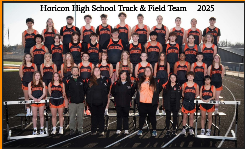
Horicon High School Track & Field Team 2025