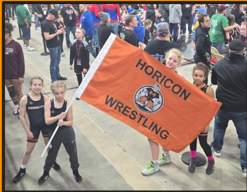
The Future of HHS Girls Wrestling!